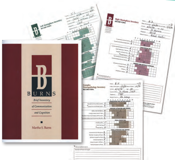
Burns Inventory manual and three inventories

Orientation and Factual Memory Auditory Attention and Memory Visual Perception Visual Attention and Memory